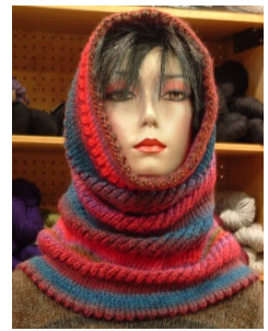
WORKED IN THE ROUND

WORSTED COWL 200gms 5st/#7 (label gauge) wool one size GAUGE 4.5 sts/in 6 rows/in NEEDLE 24" CIRC #8 (and an extra 24" 6-7-or-8) this is an expanded, worsted version of Amelia Lyon's "Willow Cowl" in fingering - see Ravelry